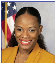
Representative Summer Lee