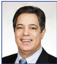
Senator Jay Costa