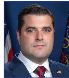
Senator Devlin Robinson