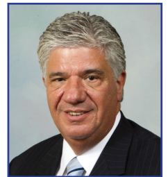
Senator Wayne Fontana